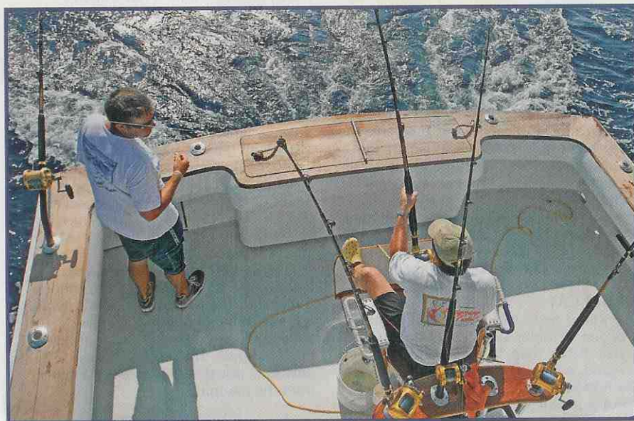
Trolling spreads on Low Profile are geared up for variety.

We left Rum Cay early the second morning and again zigzagged along the sheer wall surrounding the island. We picked up a couple of wahoo in the 40-pound class and when we reached Northeast Point, we were attacked by the pack of dolphin. Three dolphin, each weighing between 30 and 40 pounds, were added to the fish box. On the return to San Salvador that afternoon, the cedar plug was again hit by a