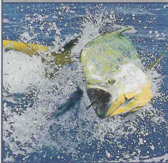
A 30-pound dolphin spoils the fun off San Salvador. This tiny island, seen from the air, top, is homebase for incredible winter action.