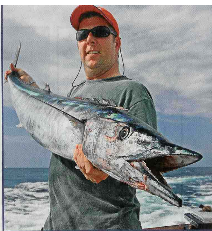
This wahoo is actually on the small side for the region. Not hard to guess what's been gnawing on that trolling plug.

Rhyme started by trolling at 9 knots, between 100 and 1,000 feet of water, hoping to entice a wahoo. Wahoo patrol these steep ledges, waiting for currents and tide changes to move bait onto and off the narrow reef. If wahoo had been our only target, the spread would have been limited to wahoo-specific lures, and Trey would have bumped up the trolling speed between 10 and 12 knots.